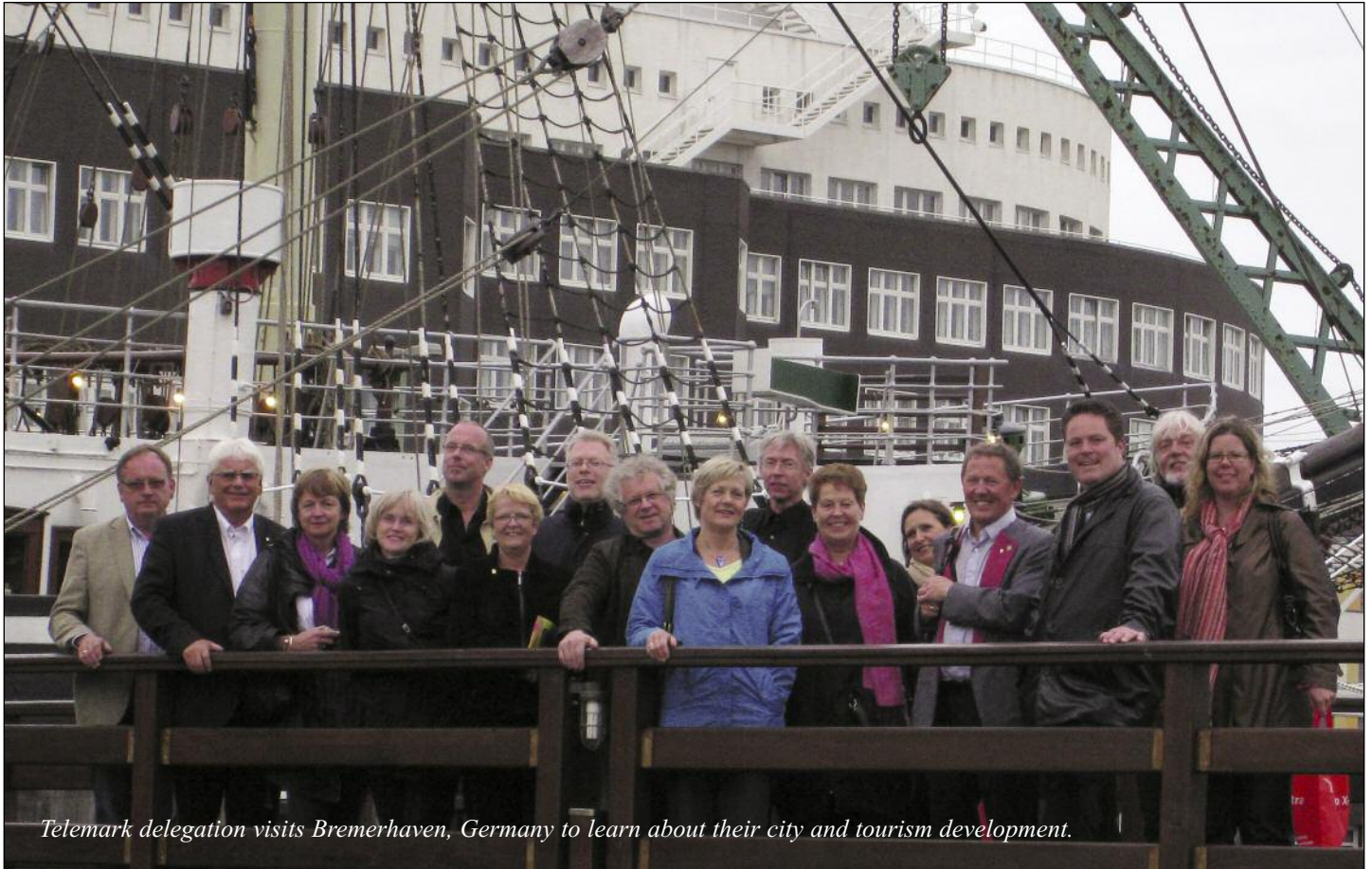
Telemark delegation visits Bremerhaven, Germany to learn about their city and tourism development.