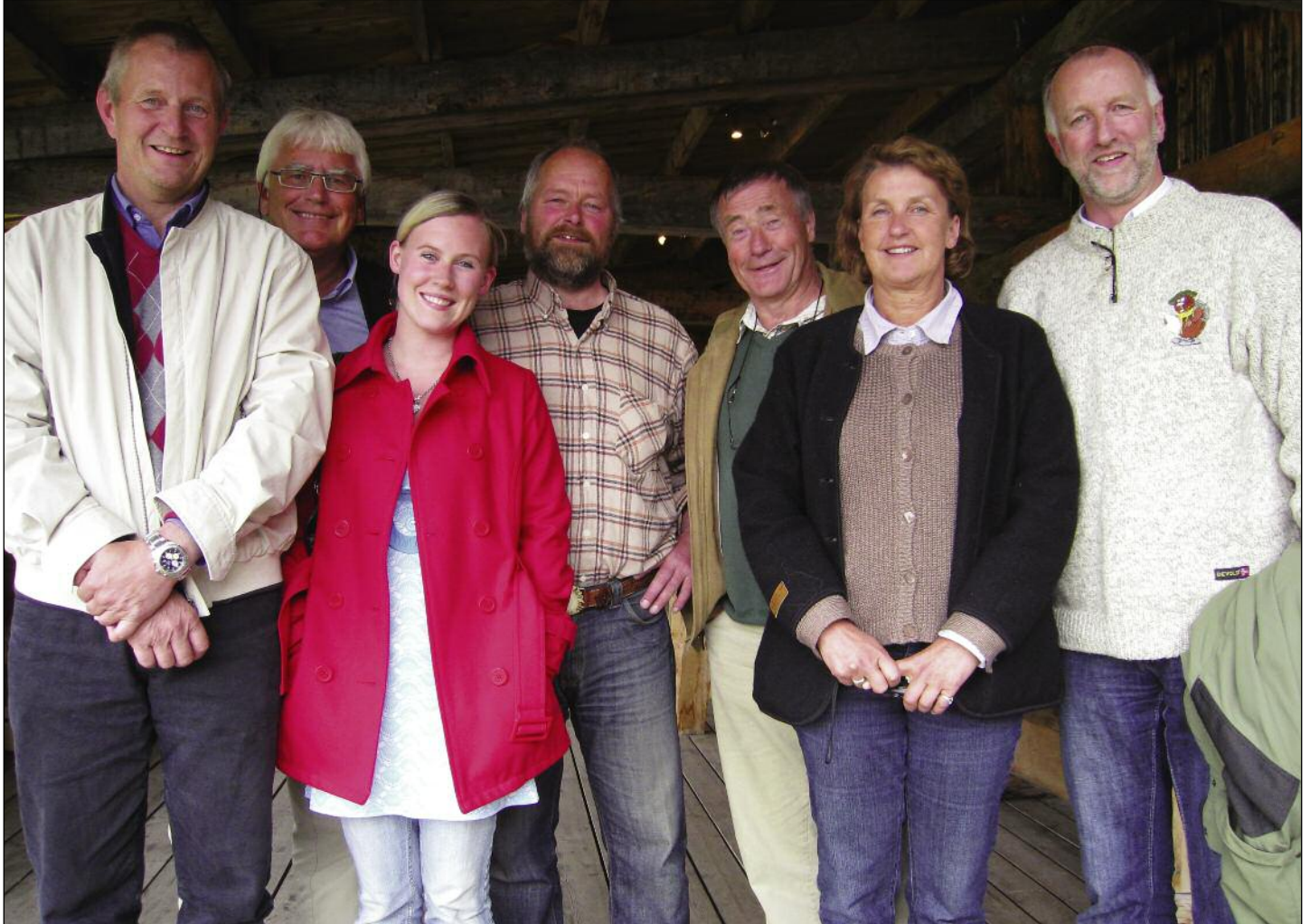
Telemark representatives who attended the Norwegian Mountain Region Cooperation annual meeting.

Savalen in Nord-Østerdalen on June 3-5. With snow and cold temperatures, the participants realized that mountain region climates can be harsh even in the summer months! More info about the conference and the activities of this organization can be found at (in Norwegian only): http://fjellregionsamarbeidet.no/index.php/arbeidsomrader/enkeltsak/arskonferanse_og_radsmtte_i_snsikre_omgjevnaer/