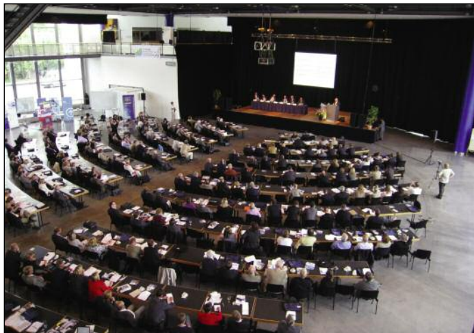
BSSSC maritime seminar participants held recently in Lübeck, Germany.

At the BSSSC board meeting in Hamburg on 3 rd February 2009 the new action plan for the period 2009-2010 was adopted. It includes the following key priorities areas: