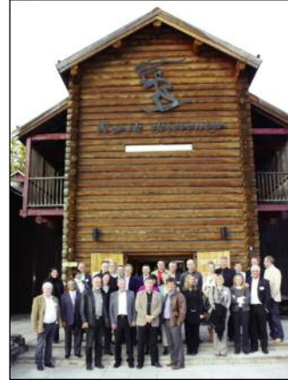
Some seminar participants outside the Norsk Skieventyr Museum where they learned about the history of Telemark skiing which originated in Morgedal.

County Council, Norsk Skieventyr, Ski Telemark Foundation, West Telemark Business Development and Innovation Norway.