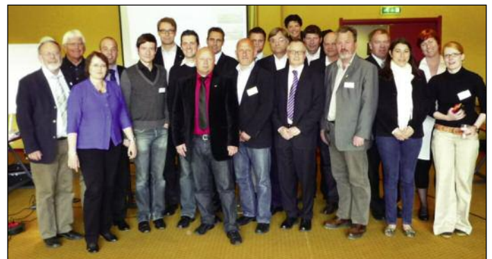
STRATMOS project European partners visit Telemark in May.