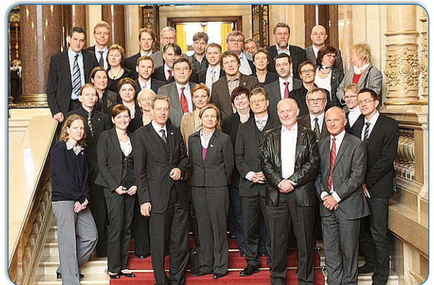
BSSSC Board meeting in Hamburg.

BSSSC regards education and science as key elements for the further development of the Baltic Sea region which is already home for a considerable number of world-class universi-