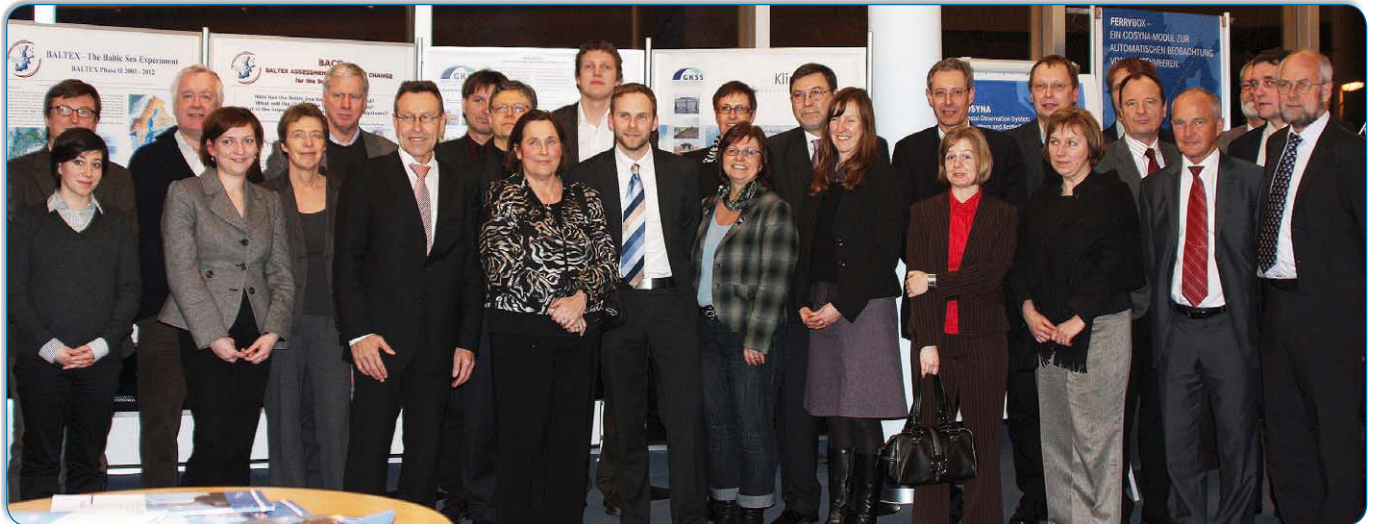
BSSSC seminar at GKSS Research Centre in Geesthacht.