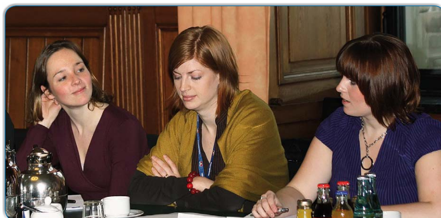
Participants at the youth conference are concerned about the environment in and around the Baltic Sea.