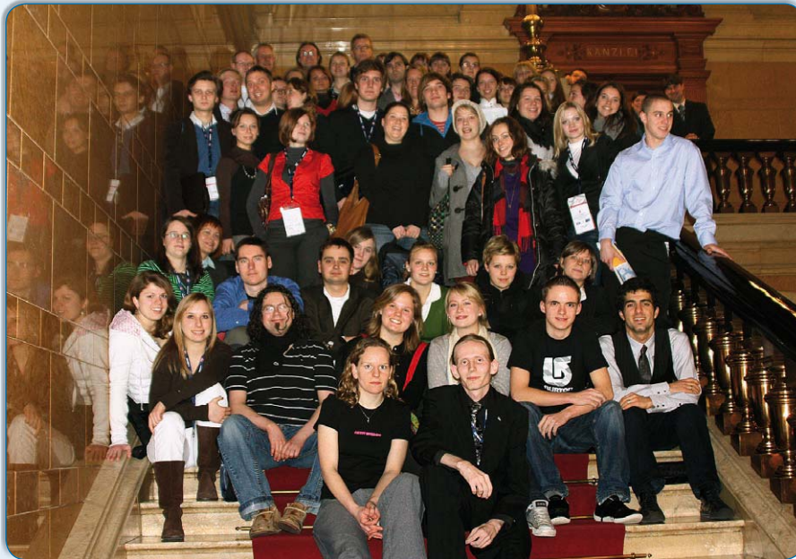
Youth conference, February 2009. Young people discussed approaches for the EU Baltic Sea Strategy in the town hall of Hamburg.