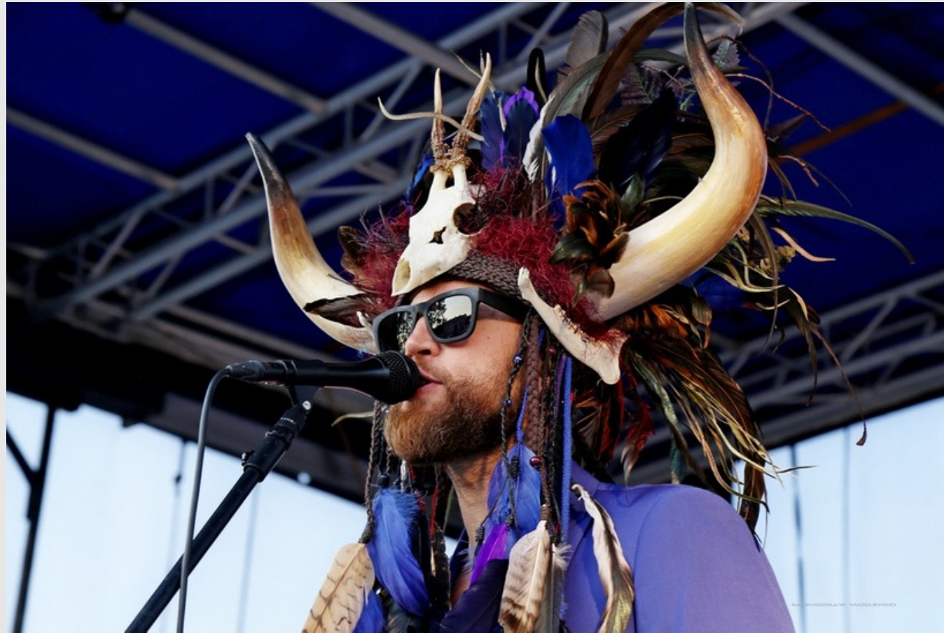
Series of concerts "On Mary's Rug"