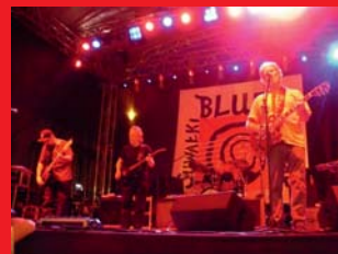
Canned Heat (USA), 2010