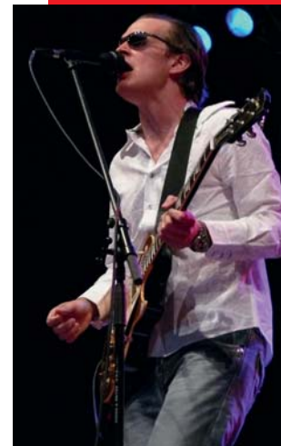
Joe Bonamassa (US), 2009