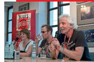
Ten Years After (UK), 2009