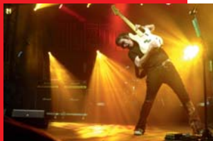
Glenn Hughes (UK), 2012