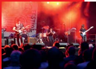
The Yardbirds (UK), 2012