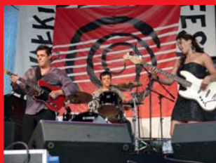
Trampled Under Foot (USA), 2009